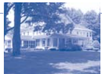
Cornish Colony Museum Building