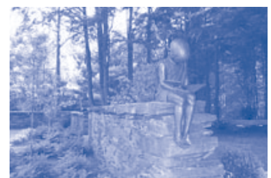
View of the garden end wall and statue